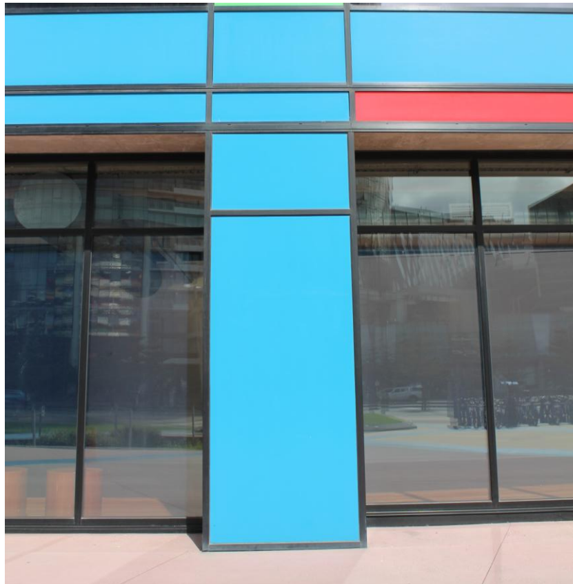
Figure 3: The Ground Floor Panel Regatta Blue