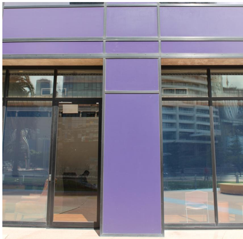
Figure 2: The Ground Floor Blue Violet Panel