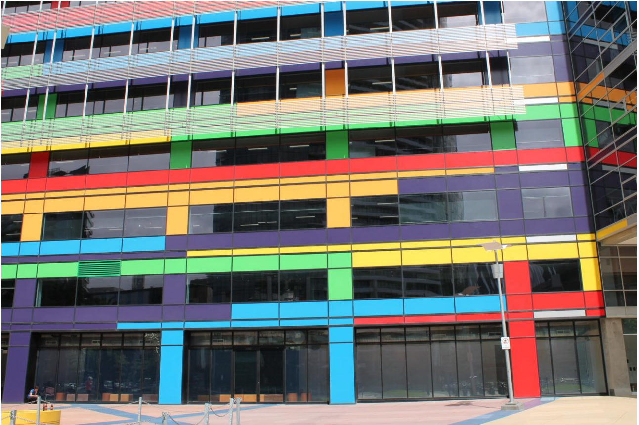
Figure 5: First & Second Story showing the Yellow and Green Colours