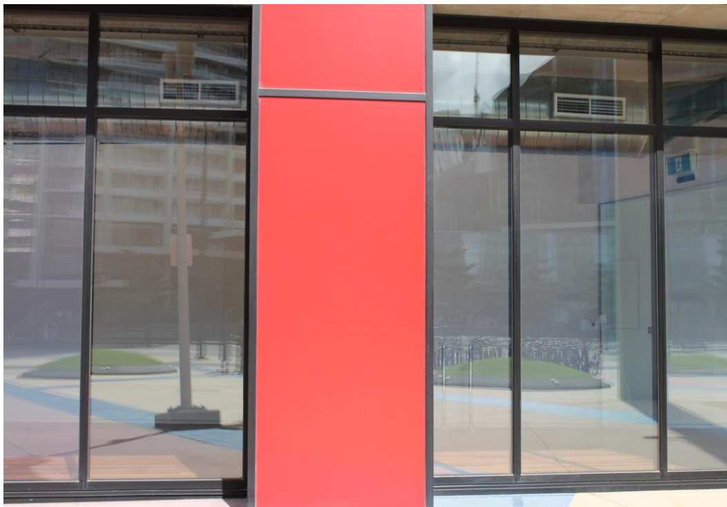
Figure 4: Ground Floor Bright Red Panel