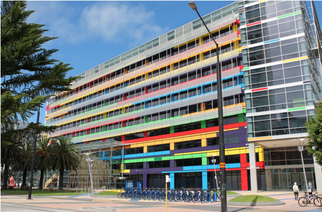
Figure 1: North Face of the NAB Building